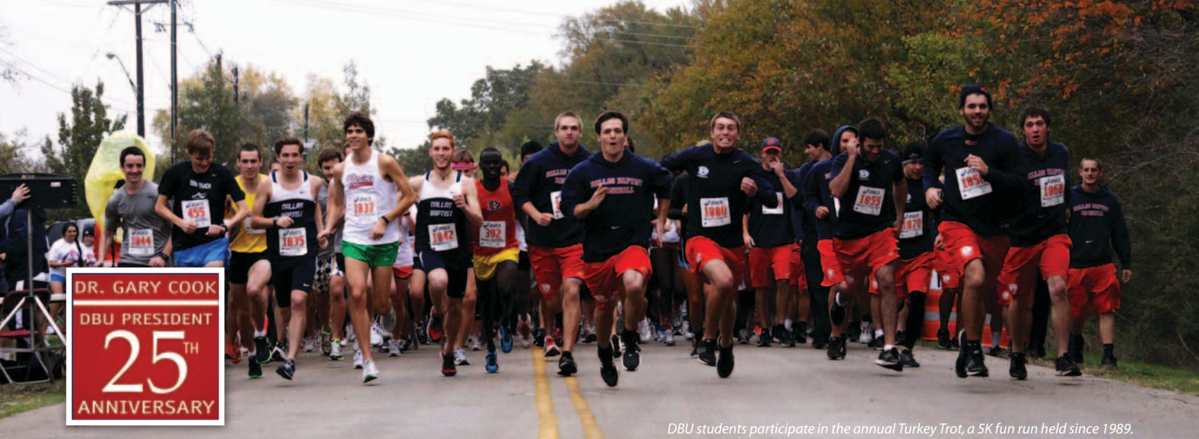
DBU students participate in the annual Turkey Trot, a 5K fun run held since 1989.