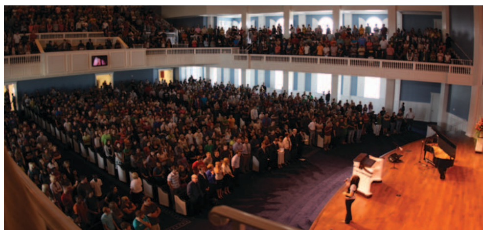
DBU students participate in the first-ever chapel service held in the Patty and Bo Pilgrim Chapel on September 2, 2009.