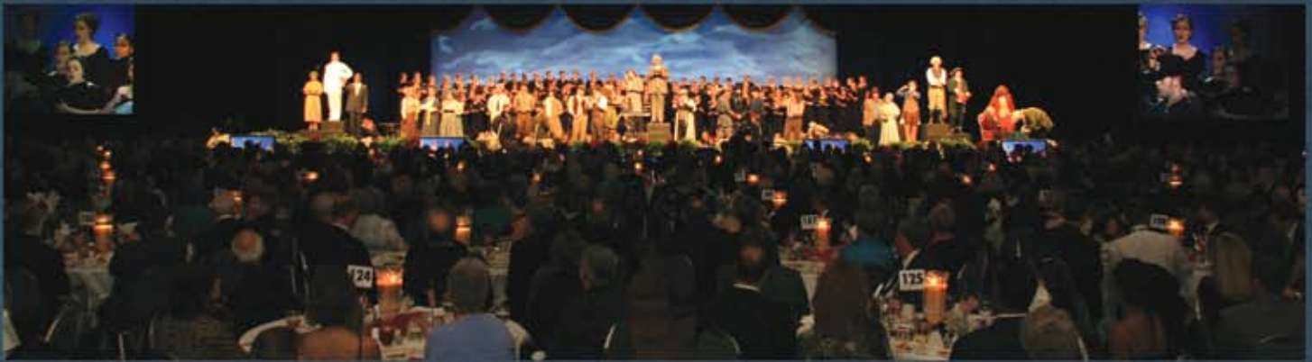
Members of the DBU Chorale performed a special musical medley honoring the United States entitled "We Are America!"