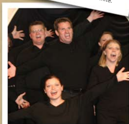
Friday evening, the Burg Center was filled with songs, skits, and fun as members of the DBU family performed during the Homecoming Extravaganza.